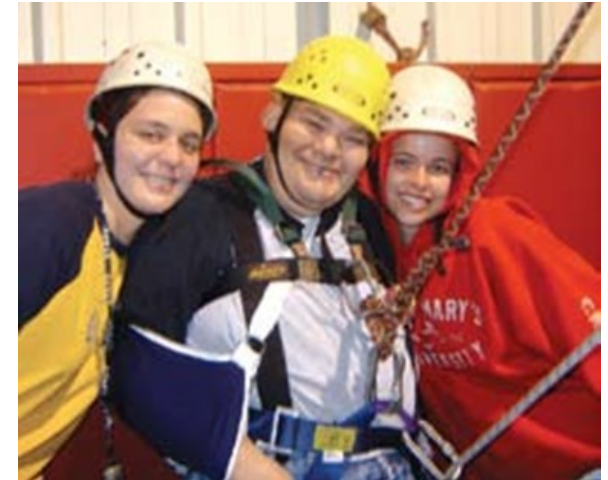
Camp Courageous provides recreational and respite care opportunities for individuals with special needs and their families.