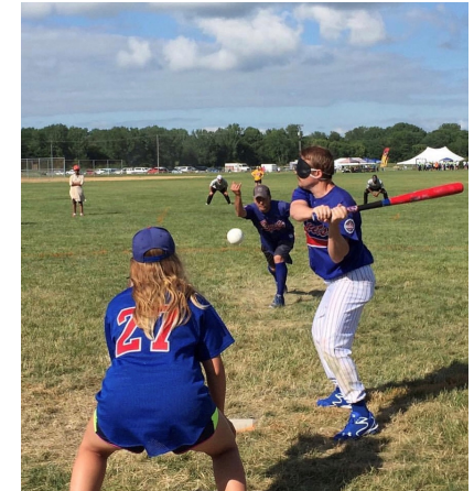
World Series Beep Ball Tournament in Ames in 2016.

Beep Ball is a variation on "America's Pastime" and is designed to be played by those that are visually impaired or blind. See adaptivesportsiowa.org for more information.