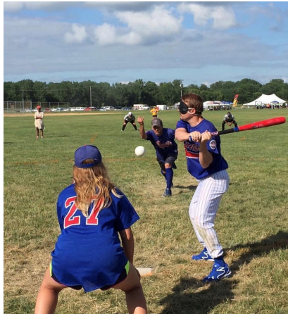
World Series Beep Ball Tournament in Ames in 2016.

Beep Ball is a variation on "America's Pastime" and is designed to be played by those that are visually impaired or blind. See adaptivesportsiowa.org for more information.