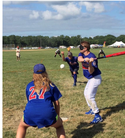
World Series Beep Ball Tournament in Ames in 2016.

Beep Ball is a variation on "America's Pastime" and is designed to be played by those that are visually impaired or blind. See adaptivesportsiowa.org for more information.