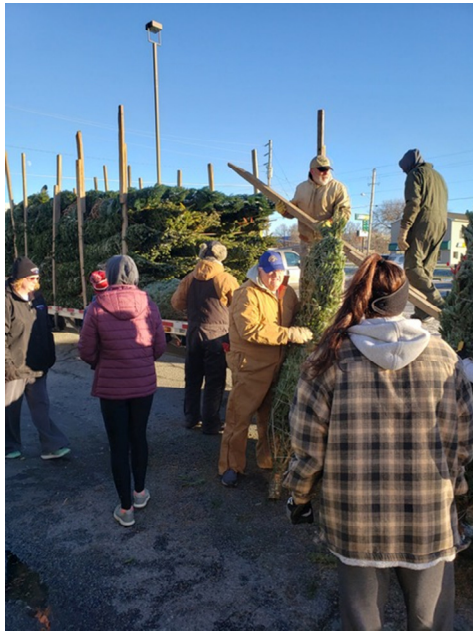
Atlantic Lions and Volunteers unloading trees for our Annual Christmas Tree Sales Fundraiser .